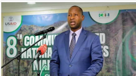
Honourable Mike Mposha, Minister of Green Economy, MP