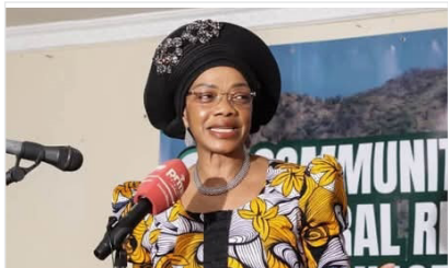
Hon. Sylvia Masebo, Minister of Lands and Natural Resources, MP

The 8th Community-Based Natural Resources Management (CBNRM) Annual Conference convened key stakeholders, including community leaders, government officials, policymakers, development partners, and academics.